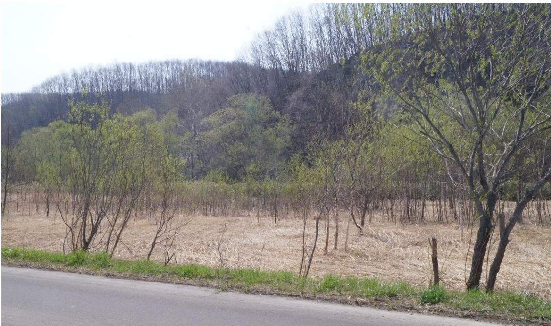
Abandoned dry farmland in central Hokkaido in Japan.

Hokkaido University's Futoshi Nakamura and his collaborators including Yuichi Yamaura of Forestry and Forest Products Research Institute, published in the journal Agriculture, Ecosystems and Environment , studied bird species distribution over an area in central Hokkaido, Japan. The group then correlated abundance and species richness of different bird communities with different degrees of farmland abandonment and the landscape structure. Mapped back onto the landscape of the known composition, this allowed them to evaluate the potential to conserve different bird communities if existing farmlands in a given area were to be abandoned.