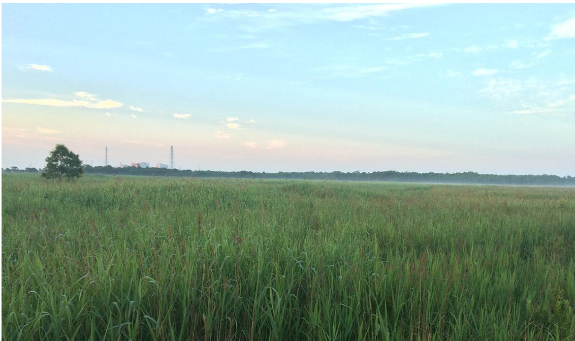
Abandoned wet farmland in central Hokkaido in Japan.

Abandoned farmlands hold potential for the preservation of wetland and grassland birds as rehabilitation zones.