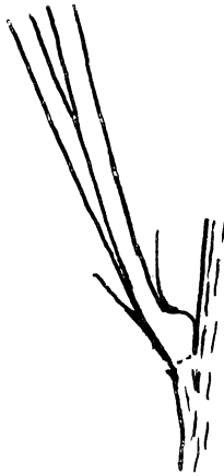
Fig. 1. Brief sketch of swelling formed on the base of a bundle covered in July.

All twigs covered in April of 1951 had already been killed by the time of preparation of cuttings and provided no living leaf-bundle, and twigs covered with blue bags in July were also seriously damaged so that only a few cuttings were obtained. Some of red covered twigs were broken but remaining ones appeared almost healthy. Many bundles covered in July, both red and blue, had been swollen at their base as shown in figure 1.